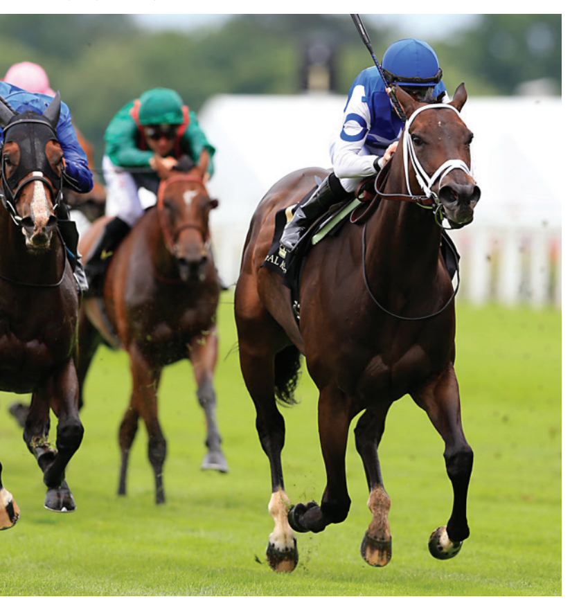
The American raider Tepin cast aside all doubts when she won the Queen Anne Stakes in 2016.

Other times, our zealous band of sporty teachers would impose the double torture of making us do a cross-country run on Ascot heath while racing was going on around us. I firmly believed this was not what Queen Anne had in mind for the nourishment of the young soul, and only served to make my desire to watch racing as fevered as my disdain for taking part in any organized games.